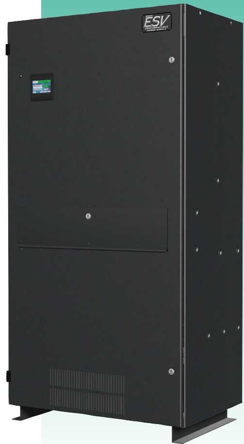
14 kVA/kW model shown