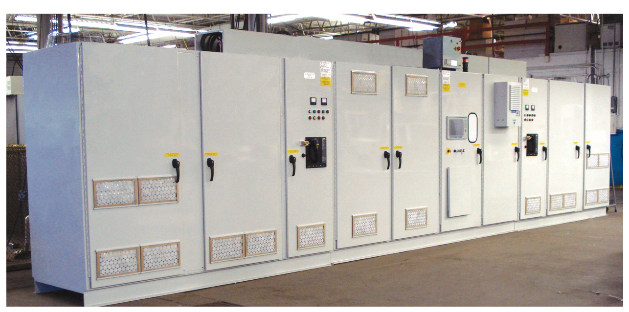
Model 5012 12-pulse system shown.