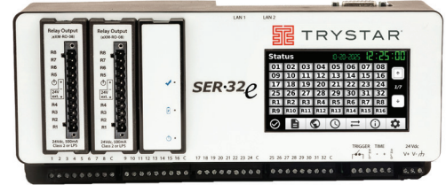
Sequence of Events Recorder SER-32e

The Sequence of Events Recorder (SER) provides precise, 1 millisecond time-stamped event recording for 32 channels to enable root-cause analysis and advanced system diagnostics. It also provides time synchronization to associated devices with support for several time protocols such as Precision Time Protocol (PTP) and IRIG-B.