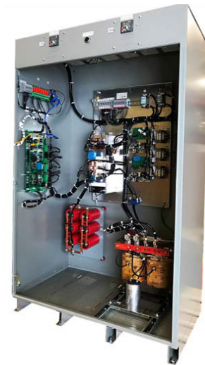
125Vdc-1ph-20 kVA inverter

For other requirements consult factory Specifications may change without prior notice P850i-2017