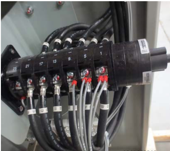
Drum type make-before-break manual